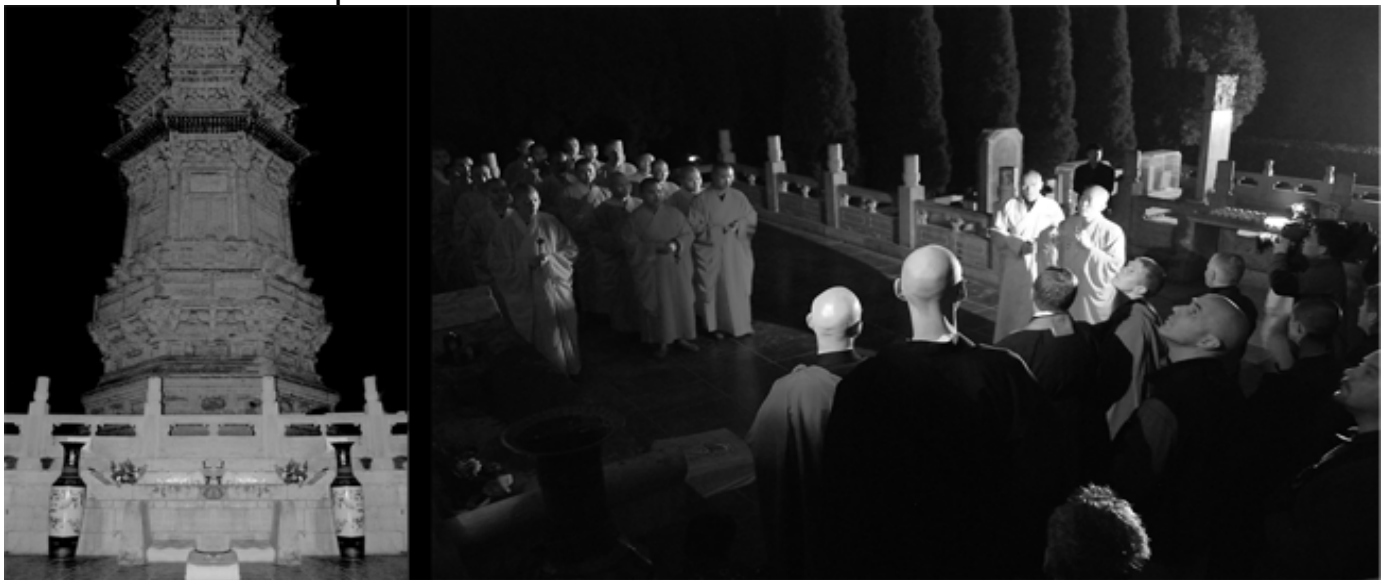
North American and Chinese Monks "Presenting Light" to Zen Master Zhaozhou's Burial Pagoda

On our tour we will learn about Chinese Zen of the past and today through lectures and practice. We will silently show our unity with our Chinese Buddhist brothers and sisters, with the Chinese people, and with all people of China and the world who seek peace and the advancement of Dharma.