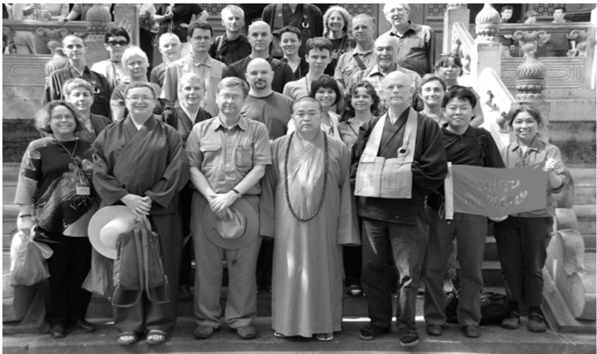
Shaolin Temple Abbot, Shi Yongxin, Meets Great Vow Monastery Pilgrimage

ZCLA Pilgrimage to Moshan, Bodhidharma's Temple